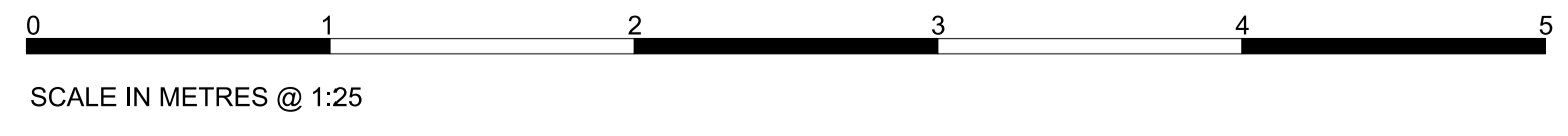
1 1:25 @ A1/ 1:50 @ A3 PROPOSED THIRD FLOOR PLAN